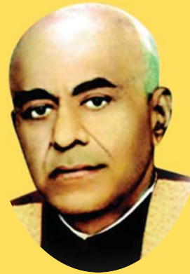
Dr. Rajah Sir M.A. Muthiah Chettiar Second Founder Pro-Chancellor